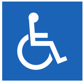
International Symbol of Access